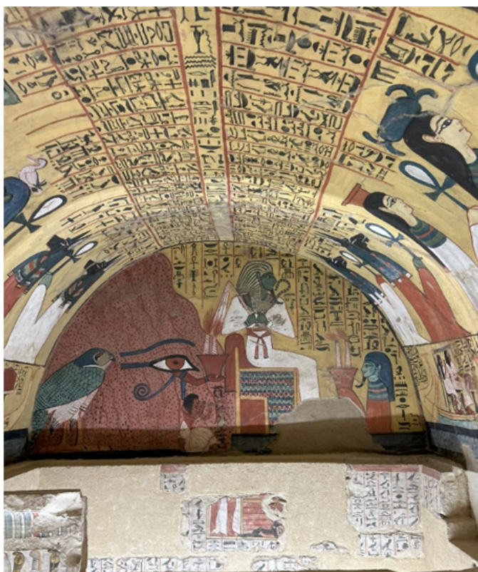
Tomb of Pashedu TT3. The burial chamber

What made my visit truly memorable was the warm welcome that I received from the local guards and caretakers. Their willingness to share their knowledge and their tea made me feel like a part of their community, leaving me with a deeper appreciation for the history and culture of the many facets of the Deir el-Medina site.