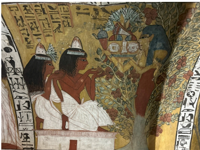
Tomb of Khaemteri TT220

An outer terraced courtyard and a chapel dug into the hillside lead to the tomb of Pashedu (TT3), considered one of the most beautiful of the Theban tombs, and is colourfully decorated with a bright yellow background.