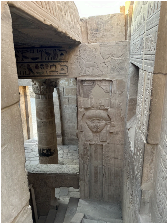
Temple of Hathor, corridor leading to the rooftop (left)