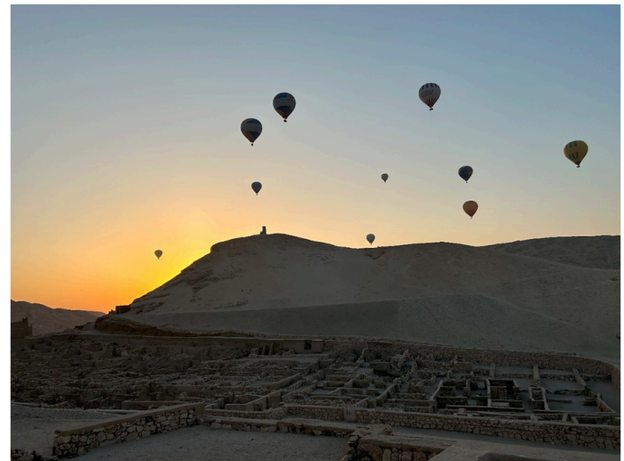
View of the walled workman's village at sunrise

Most notable, of course, is the well-preserved settlement of the workman's village that bids an exceptional insight into the daily lives of the ancient Egyptians who tirelessly created the famous New Kingdom tombs in the Valleys of the Kings and Queens. The numerous documents and inscriptions found on papyri and ostraca at the site have provided