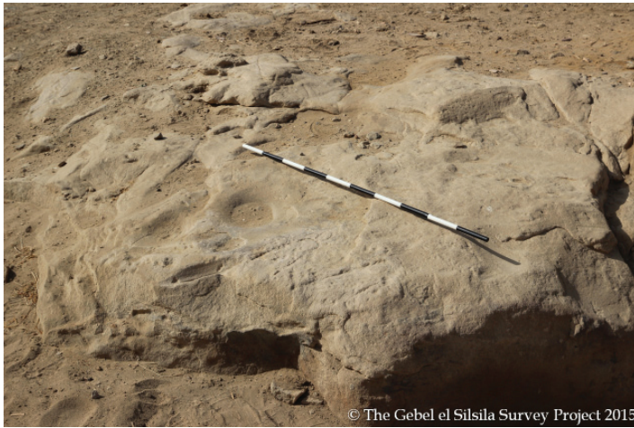
Figure 3 - Dynastic foot graffiti & Predynastic cupules

and outer walls and archaeological evidence for at least four different chronological periods. The remains of five dressed and raised column bases were located in the temple's western partition, each measuring approximately 1.40 m in diameter and located 3.20 m apart, 8.40 m across. To the east of the column bases are two dressed and raised squared areas, presumably indicating the architectural divide within the structure (indicating the pronaos). Further to the east and placed centrally is a raised and dressed platform with surrounding below-laying dressed sandstone surface, parts of which have received linear positioning/indication marks (single and double incised marks) that run in an easterly to westerly direction and indicate the position of interior and exterior walls, including the walls of four chambers, with each room measuring approximately 3.10 – 3.20 m wide. The exterior walls generally follow natural fractures and formations in the bedrock. The perimeter of the northern exterior wall is further indicated by the presence of dynastic foot graffiti, located adjacent with Predynastic petroglyphs and cupules (Figure 3).