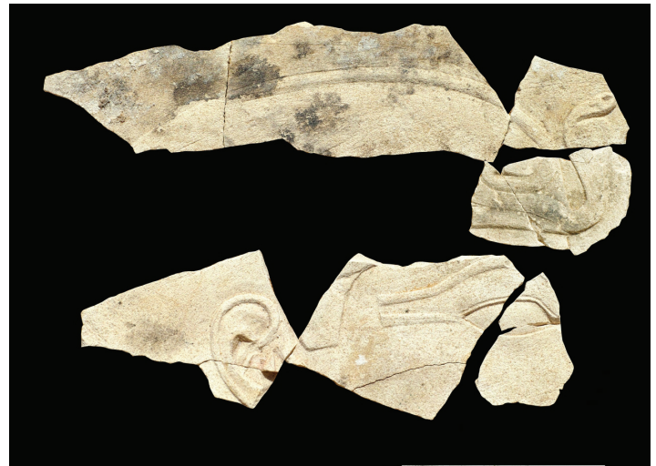
Figure 5 - Relief fragments re-used as foundation rubble

Visit the SSEA/SÉÉA website at www.thessea.org