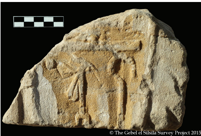
Figure 4 - Hieroglyphic Text fragments

and outer walls and archaeological evidence for at least four different chronological periods. The remains of five dressed and raised column bases were located in the temple's western partition, each measuring approximately 1.40 m in diameter and located 3.20 m apart, 8.40 m across. To the east of the column bases are two dressed and raised squared areas, presumably indicating the architectural divide within the structure (indicating the pronaos). Further to the east and placed centrally is a raised and dressed platform with surrounding below-laying dressed sandstone surface, parts of which have received linear positioning/indication marks (single and double incised marks) that run in an easterly to westerly direction and indicate the position of interior and exterior walls, including the walls of four chambers, with each room measuring approximately 3.10 – 3.20 m wide. The exterior walls generally follow natural fractures and formations in the bedrock. The perimeter of the northern exterior wall is further indicated by the presence of dynastic foot graffiti, located adjacent with Predynastic petroglyphs and cupules (Figure 3).