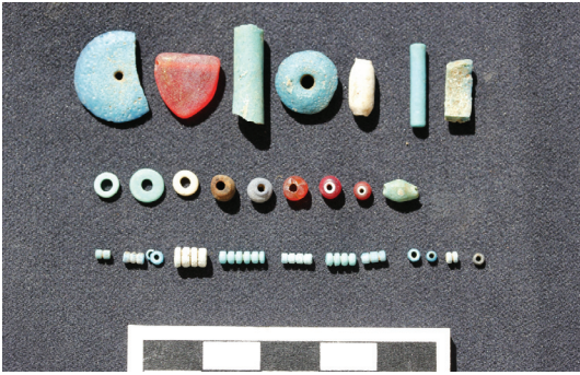
Figure 8 - Beads