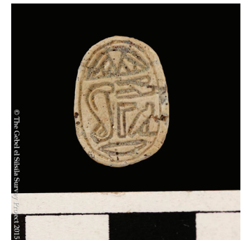
Figure 10 - Faience scarab

Among the small finds discovered in the temple area were several 18 th Dynasty beads (Figure 8), coloured plaster, faience sherds (Figure 9), thousands of pot sherds, and a blue-coloured scarab (Figure 10) presumably dating to the 2 nd Intermediate Period (Hyksos). Digital 3D recording was carried out in the end of the season, but further archaeological work is necessary to present a comprehensive report of the area.