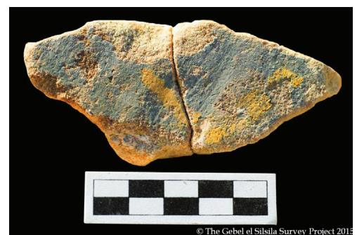
Figure 7 - Painted ceiling fragment showing part of star

– thus, evidence of two later temple phases. In addition, two painted sandstone fragments bear decoration of the dark sky and Egyptian star (Figure 7), indicating that the temple was complete with ceiling. A fourth chronological period can be added based on late Ptolemaic – early Roman storage activity.