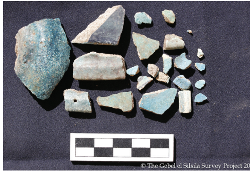
Figure 9 - Faience fragments