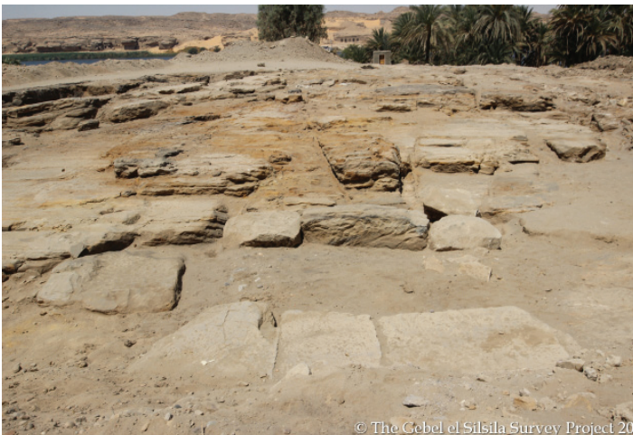
Figure 1 - The Temple of Kheny