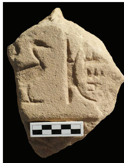
Figure 6 - Fragment of royal name of Ramses II

decorated (raised and painted relief) limestone fragments revealed iconography characteristic to the early Thutmomid period, and the hieroglyphic text included the name of the site - Kheny (Figure 4). The limestone scenes had been destroyed during antiquity to be reused as foundation filling together with sand and pebbles for a later construction phase (Figure 5). The foundation of a square decorated limestone base was still intact. Another almost 300 decorated (raised and sunken relief, included painted) fragments included the cartouches of two later rulers – Amenhotep III and Ramses II (Figure 6)